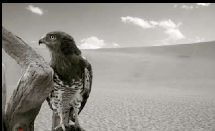
Hawk and Sand dune (Sahara)