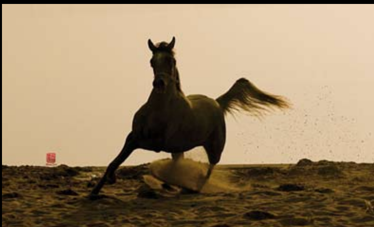
Son of the desert (1 year old colt)