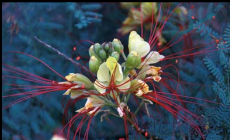
Flower in an oasis (Sahara)