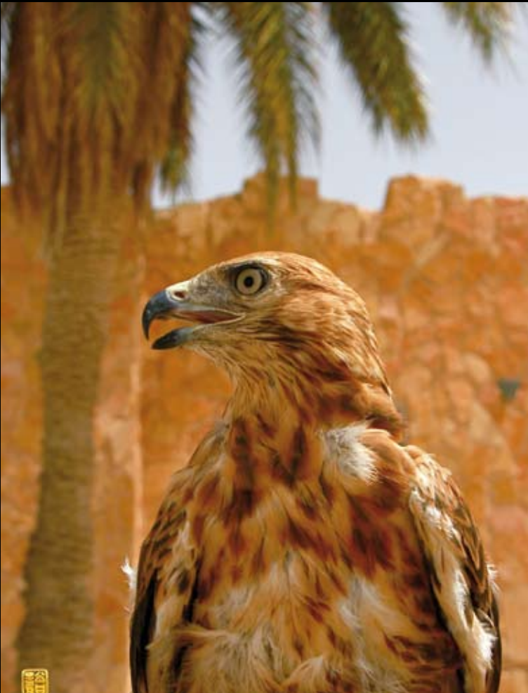
Hawk in the desert