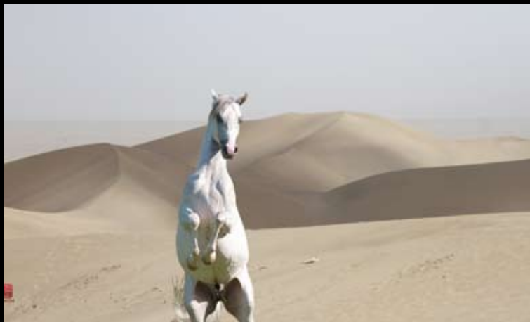
Arabian horse and sand dune