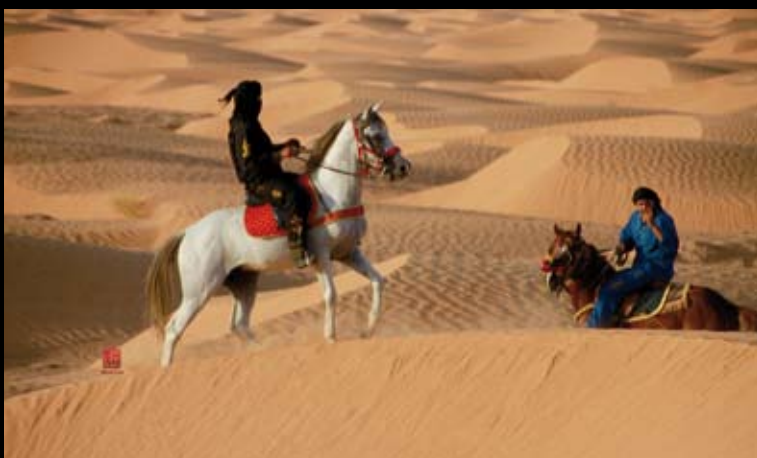
Arabian horses in the Sahara Desert