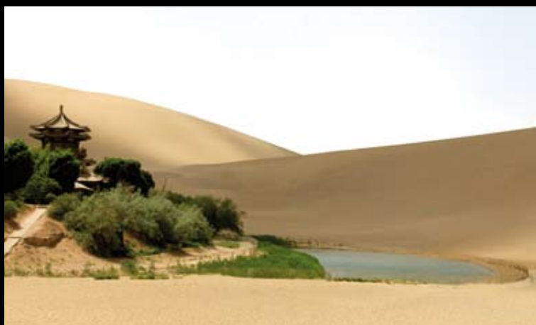
Oasis in the Gobi desert (Inner Mongolia, China)