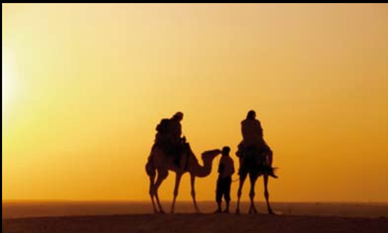
Sunset and camel in the Sahara (Tunisia)